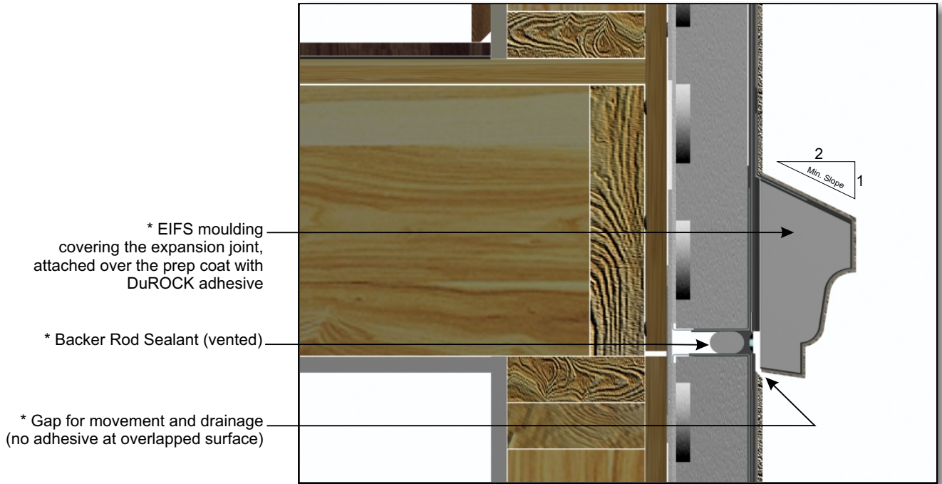
PUCCS-LRRC (07) HORIZONTAL EXPANSION JOINT WITH MOULDING OVERLAPPING